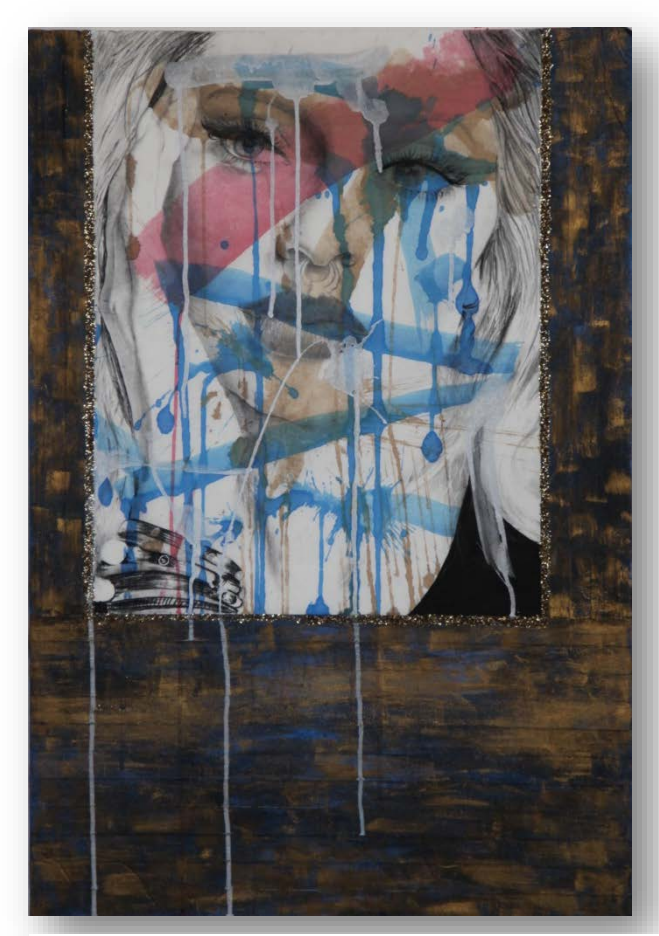
Figure 10: Deconstruction Kylie Jenner 2016

`I continued working with the idea of wearing masks and how we chose to wear the masks we put on. I started to question; how much of the true self do we bring forward to others? What messages can be brought across