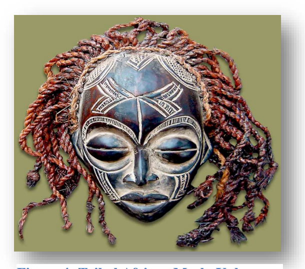
Figure 4: Tribal African Mask. Unknown

Nonetheless, in contemporary art, there is a