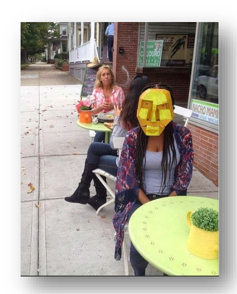
Figure 7: Masked Baes 2014

being and the desire for eternal afterlife. In explaining his reason for such extremity and provocation he comments "It depends on my life to be created – it's made from the substance of me; and so I think of it as the purest form of sculpture - to sculpt your own body, from your own body." Quinn wanted to move away from an average attempt to self-portraits, therefore instead he uses a culturally mediated approach by making use of his blood as a