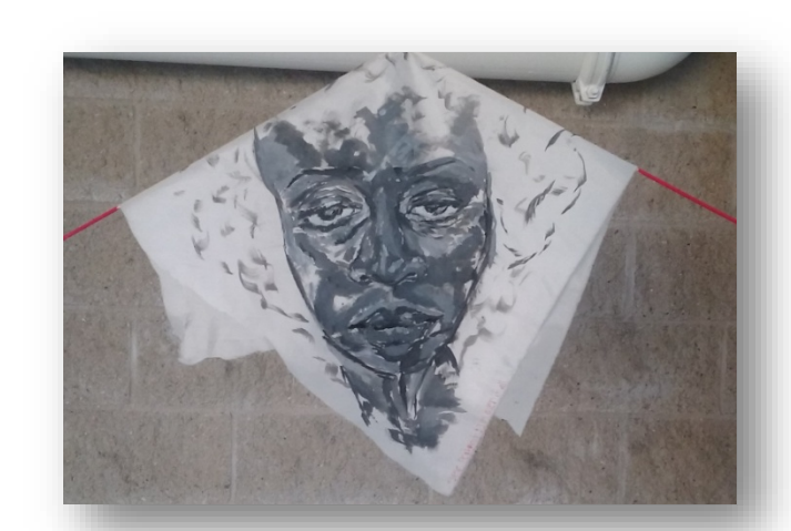
Figure 11: Masked Self Portrait 2016

the various facades and masks that we wear daily? My keys ideas are translucency and concealing, understanding identities through an object, and placing objective history and responsibility on others. As time passed, I focused more on the creation of the masks