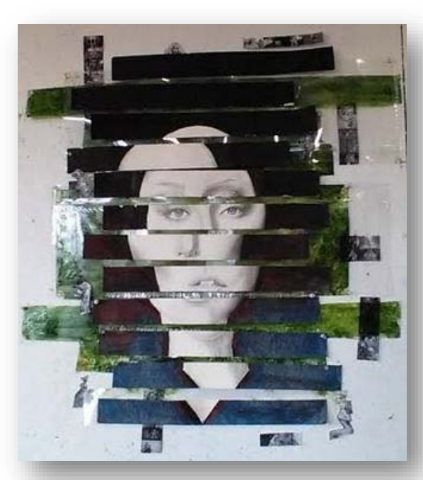
Figure 9: Deconstruction Lady Gaga 2013

Revisiting this idea of deconstruction, and using the methods explained in creating masks I explored the physical act of destroying the perfect image