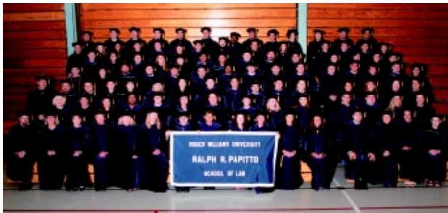
Congratulations to the Class of 2003!