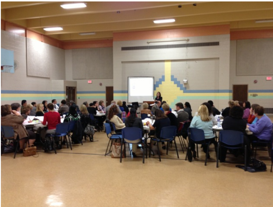
Edwards Wildman attorney talks to staff at Children's Friend RI about housing rights, best practices and how to maximize the services provided by the PBC.