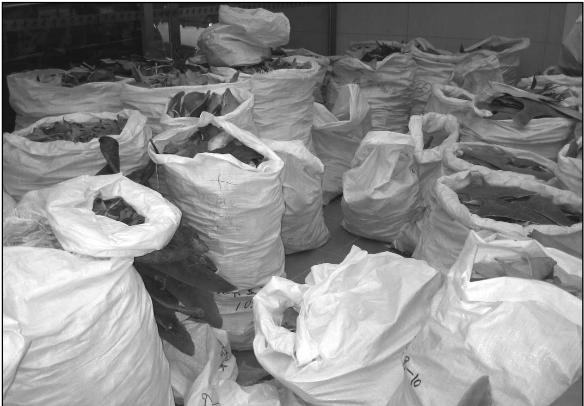
Photograph of bags of shark fins courtesy of Jessica King, Marine Photobank.