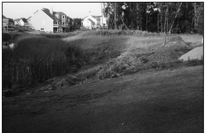
Photograph of Oxbow Creek