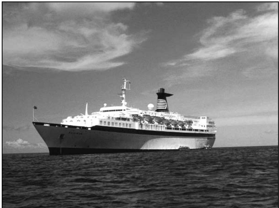
Photograph of ocean-going ship