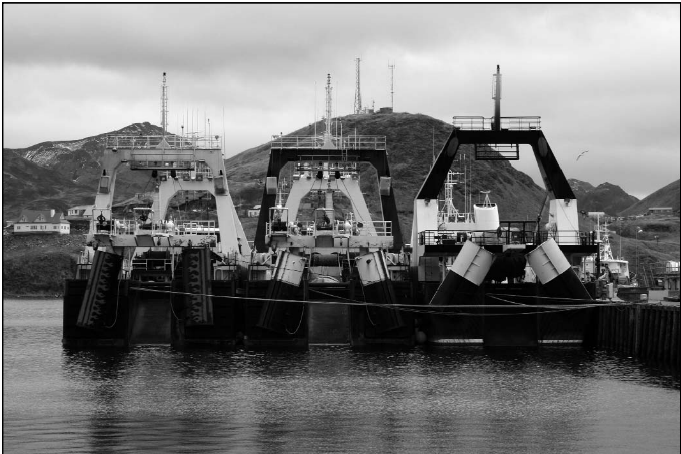
Photograph of Alaskan fishing boats courtesy of Valerie Craig/Marine Photobank.