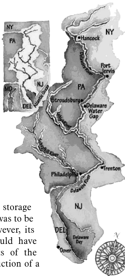
Map of Delaware River Basin.

In 2005, invoking the Supreme Court’s “original jurisdiction” for disputes between states, New Jersey brought suit against Delaware challenging Delaware’s authority to deny the LNG plant. The Supreme Court appointed a special master to review the issues, and in April 2007 the special master filed a report agreeing with Delaware’s interpretations of a 1905 Compact between the two states, and concluding that Delaware had the authority to deny construction of the LNG plant. The special master’s recommendation in such a case is nonbinding, and the Supreme Court subsequently heard the case, with Justice Stephen Breyer recusing himself because he owns British Petroleum stock.