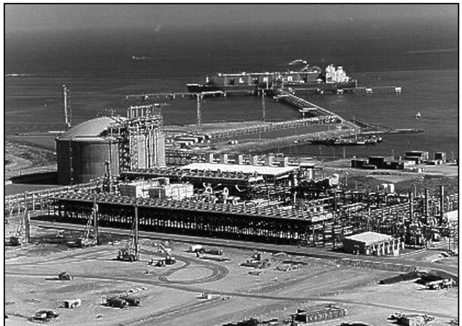
Photograph of LNG terminal courtesy of the Federal Energy Regulatory Commission (FERC).