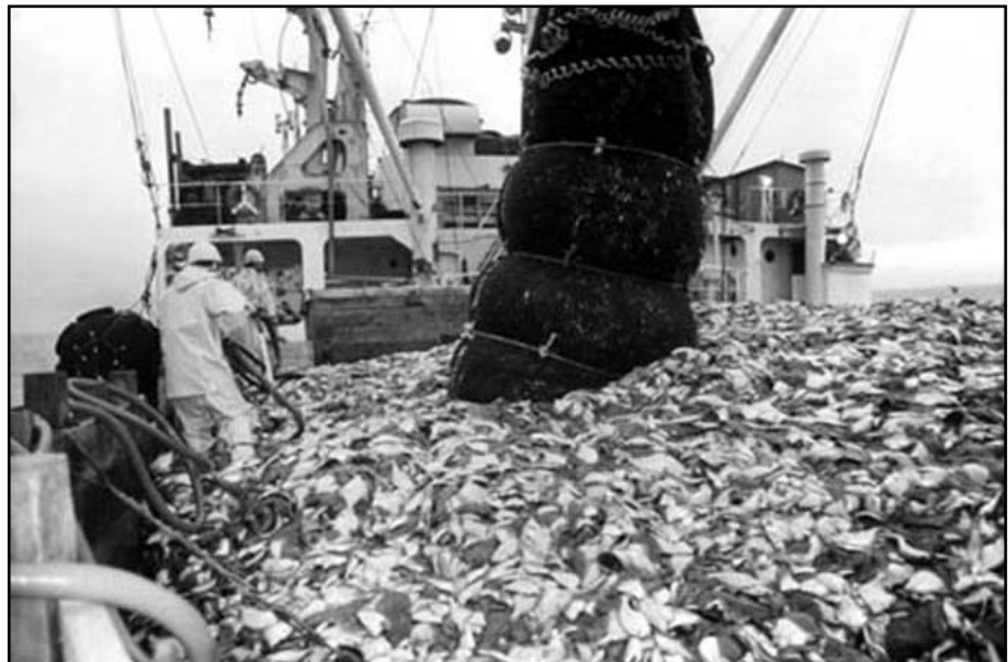
Photograph of commercial fishermen courtesy of NOAA’s National Marine Fisheries Service.