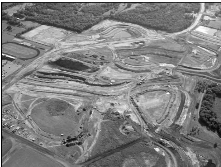
Photograph of Oxbow Creek