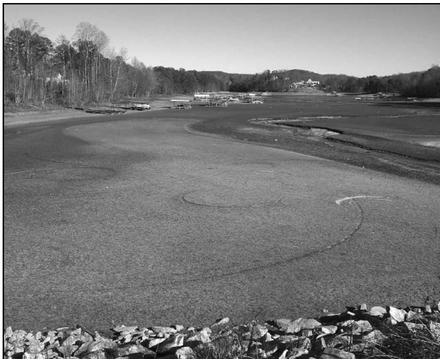
Photograph of drying banks of Lake Lanier courtesy of NOAA's National Weather Service Forecast Office.