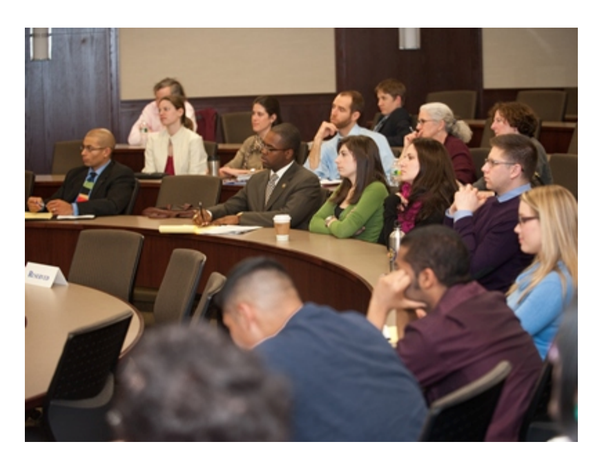
Students, faculty, staff and attorneys attend the MLK Celebration Keynote Address