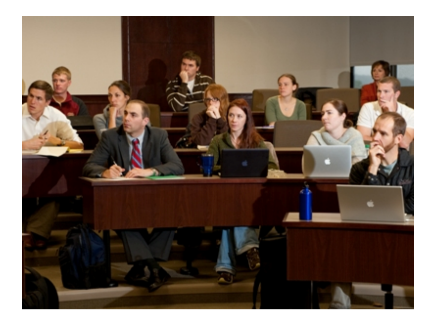
A rapt audience