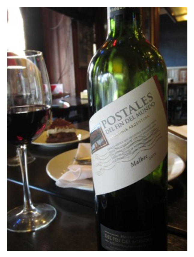
Local wine and baked goods