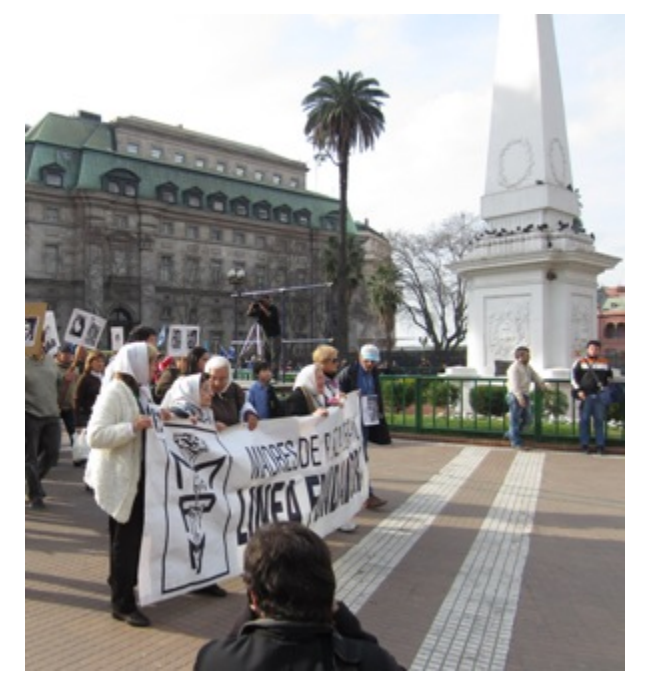
Madres de Plaza de Mayo- an association of Argentine mothers whose children disappeared during the Dirty War of the military dictatorship between 1976 and 1983