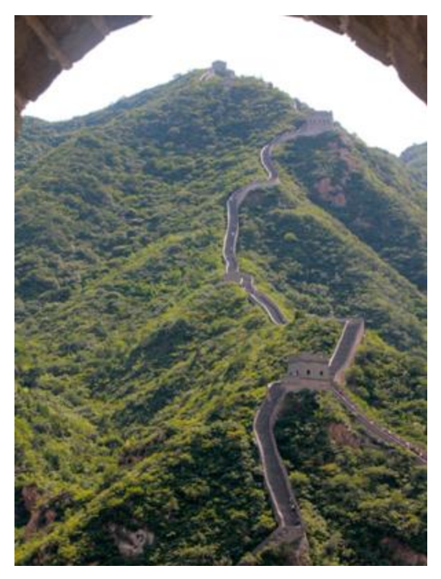
The Great Wall of China