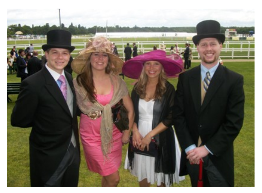
Royal Ascot