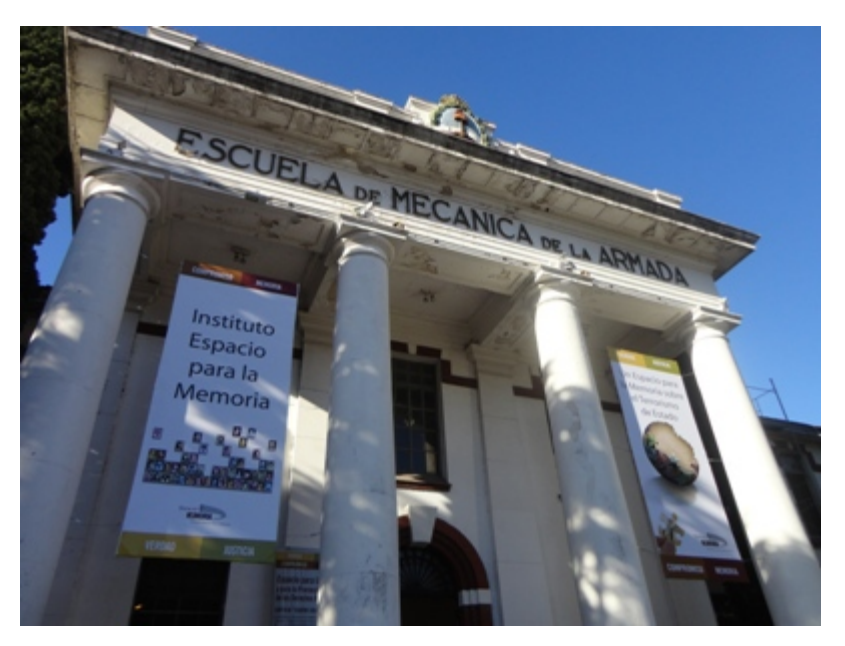
Escuela Mecanica de la Armada