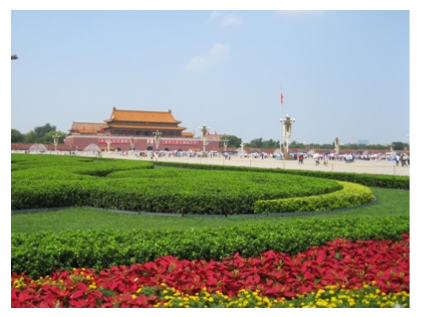
Tiananmen Square