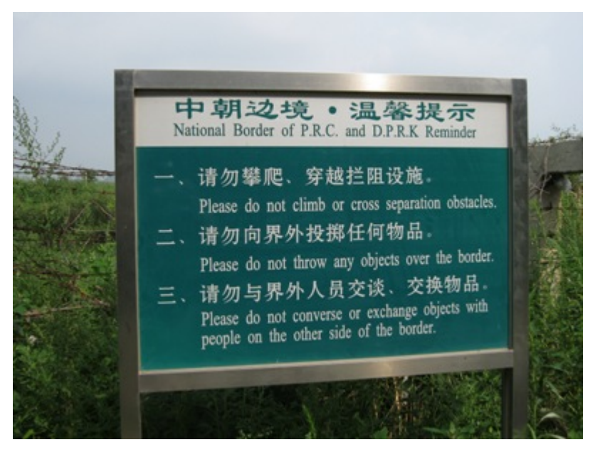
"Reminder" Notice at Chinese-North Korean border