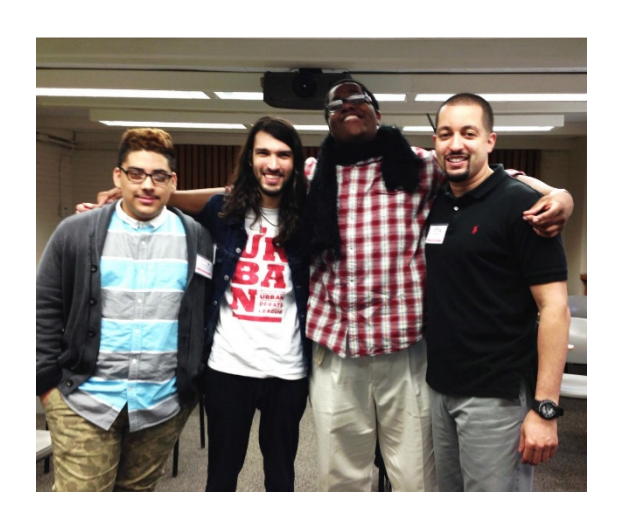
Some of the Competitors