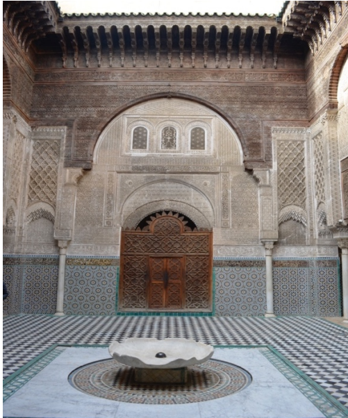
Université al Qaraouiyine The World's Oldest University, Fes, Morocco

The mission of SASH is to provide an opportunity for undergraduate and graduate students to share their academic and creative activities with the RWU community. SASH represents our collective intellectual accomplishments as a university during the academic year.