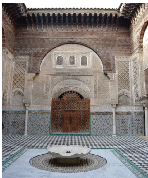
Université al Qaraouiyine The World's Oldest University, Fes, Morocco

The mission of SASH is to provide an opportunity for undergraduate and graduate students to share their academic and creative activities with the RWU community. SASH represents our collective intellectual accomplishments as a university during the academic year.