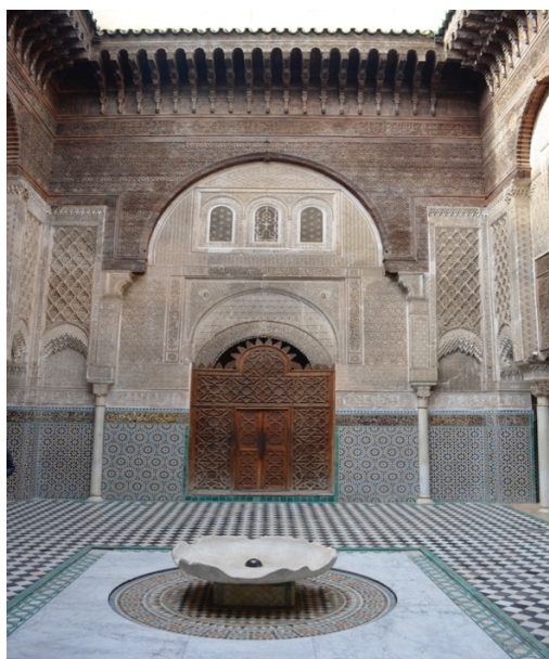
Université al Quaraouiine The World's Oldest University, Fes, Morocco

The mission of SASH is to provide an opportunity for undergraduate and graduate students to share their academic and creative activities with the RWU community. SASH represents our collective intellectual accomplishments as a university during the academic year.