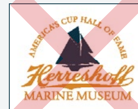
Don't use color in text logo