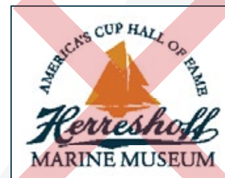
Don't use colors in boat logo