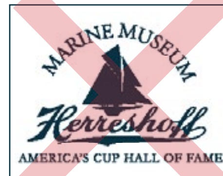
Don't switch the taglines on the logo