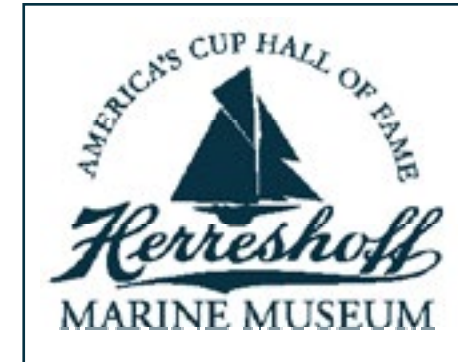
Do leave blue logo on white background