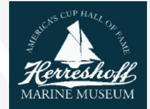
Do use white logo with blue background