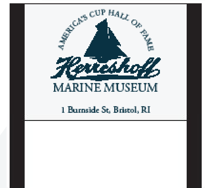
White Background Outdoor Sign