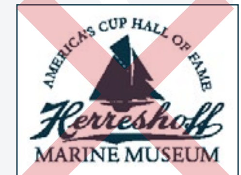
Don't use opacity on logo