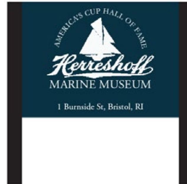
Blue Background Outdoor Sign