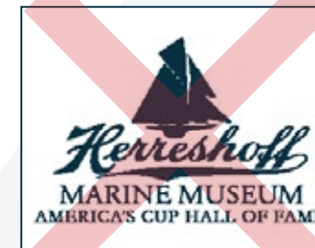
Don't switch have taglines on bottom