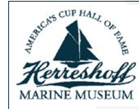
Do align proper arrangement and sizing