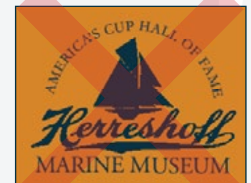
Don't use color in background logo