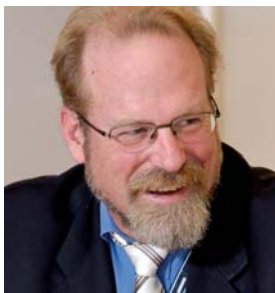
Steve Sawyer - Moderator Secretary General Global Wind Energy Council

Steve Sawyer joined the Global Wind Energy Council as its first Secretary General in April 2007. The Global Wind Energy Council represents the major wind energy associations (China, India, Japan, Australia, Canada, USA, Europe, Germany, Spain and Italy) as well as the major companies involved in the global wind industry. As of the end of 2007, cumulative global installed wind power capacity exceeded 94,000 MW, with over 20,000 MW installed in 2007, representing capital investment of around 25 billion euros. See http://www.gwec.net .