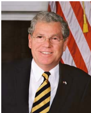
Donald C. Carcieri Governor State of Rhode Island