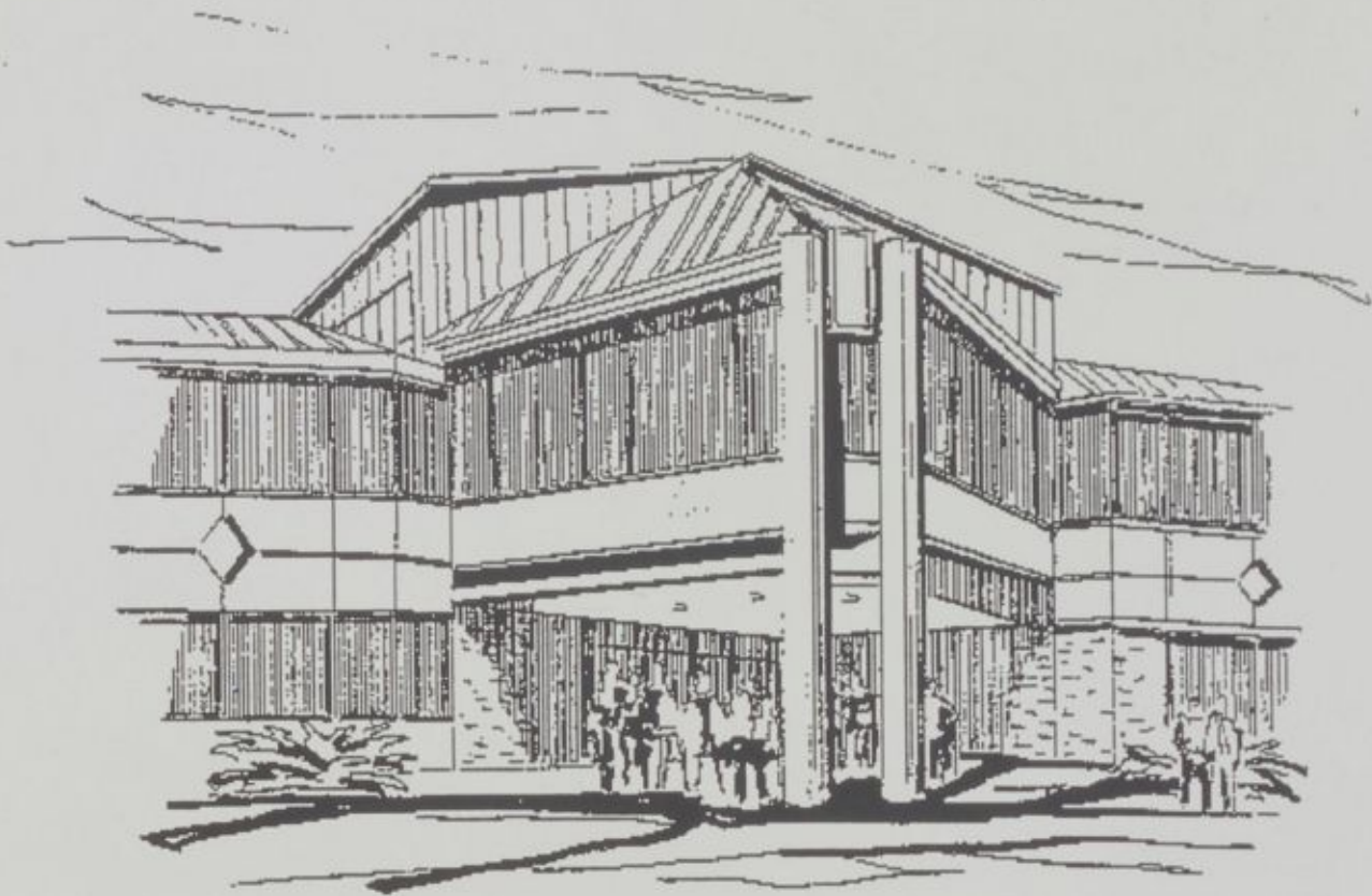
ROGER WILLIAMS UNIVERSITY RALPH R. PAPITTO SCHOOL OF LAW Bristol, Rhode Island

Roger Williams University School of Law offers a challenging education to students of law at an institution whose hallmark is excellence. There is close interaction between students, faculty and staff; interaction uniquely available in a small institution where all are laboring toward a common goal. With a faculty/student ratio of 20:1, the faculty is accessible to students.