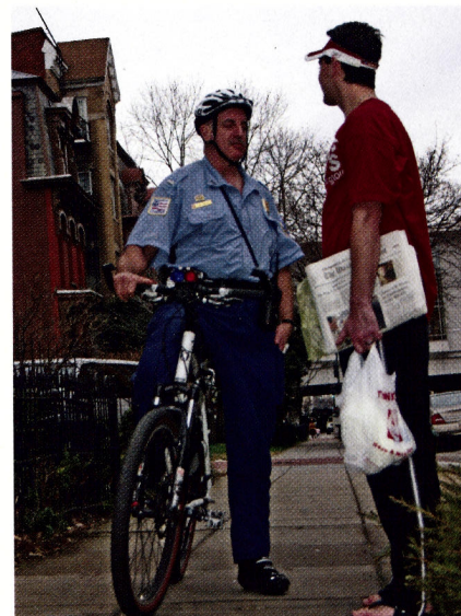
A higher amount of contact with the public is made with bicycle officers compared to motor officers.

with serious incidents, arrests, auto impoundments, and responses to serious crimes, were not significantly different than those of automobile patrols. Oftentimes, the radio calls that the bicycle patrol officers did answer were general calls that were sent out to "any avail-