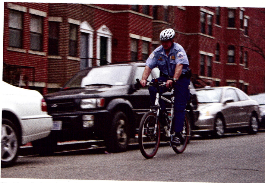
Stealth and silent approach has both advantages and disadvantages.

convergence in a housing complex on an apartment that was suspected to be carrying on illegal activity. The problem reported by the motor patrol officer whose sector the complex was in, was that automobile entrance to the complex was far enough away from the specific apartment that a lookout would see the police pull in and simply close the door. Three bicycle patrol officers came in from the opposite direction, one apartment away, on a footpath and confronted