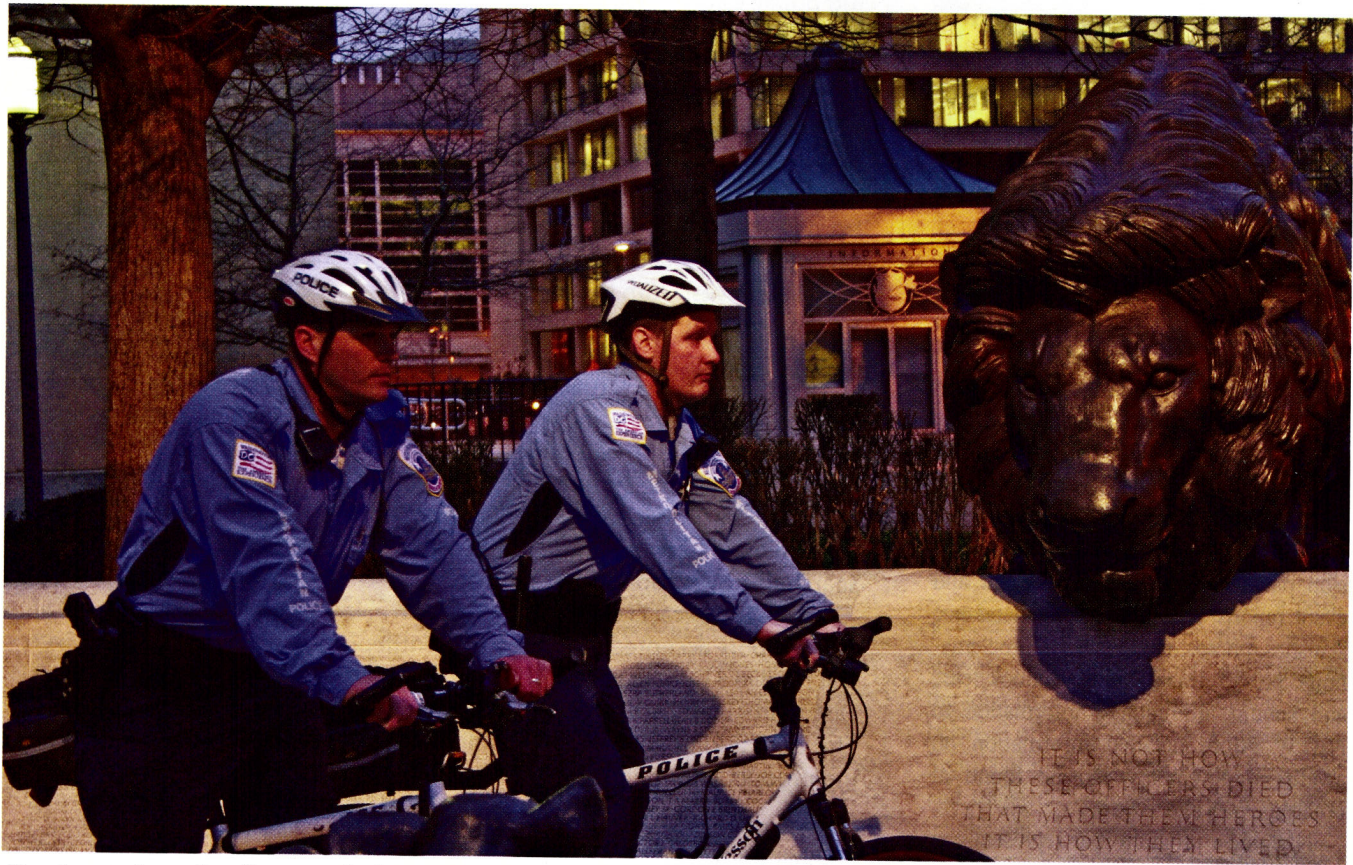
Bicycle patrols can be effective in dealing with disorders and a show of force in troubled areas.

H ow do police bicycle patrols compare with police motor patrols? In this study, both were observed under similar conditions in five cities with populations of more than 100,000. All contact the police officers had with the public was recorded and coded. The results