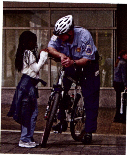
Bicycle patrols have a significantly higher amount of non-serious contacts.

convergence in a housing complex on an apartment that was suspected to be carrying on illegal activity. The problem reported by the motor patrol officer whose sector the complex was in, was that automobile entrance to the complex was far enough away from the specific apartment that a lookout would see the police pull in and simply close the door. Three bicycle patrol officers came in from the opposite direction, one apartment away, on a footpath and confronted