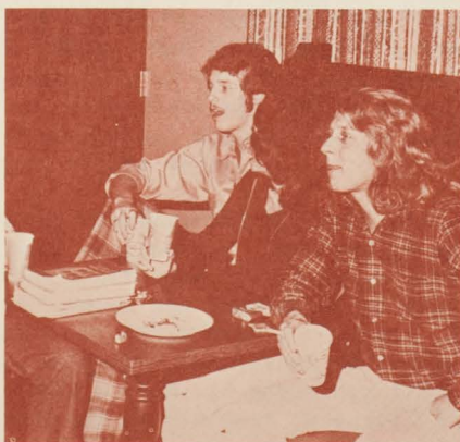
The Student Center: NEW DIMENSIONS