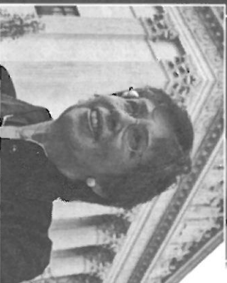
Commencement Speaker Linda Greenhouse Supreme Court Correspondent