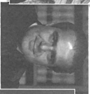
Associate Justice Antonin G. Scalia