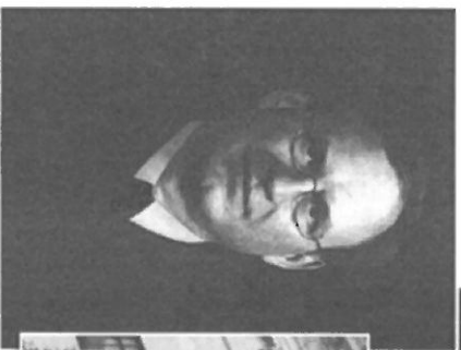
Associate Justice Samuel A. Alito