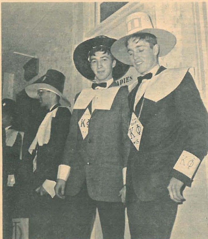
KAPPA PHI Pledges.

Whatever the results show, an encouraging note is the Selective Service's announcement that possibly, because of the high rate of recent enlistments, they might not have to tap the colleges. This would eliminate the ever-present threat that the Selective Service will judge a student's draft eligibility by examining his class rank at one arbitrary point in his college career. In any event, the QUILL would like to express its thanks to those teachers who participated in this poll.