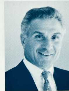
Nicholas A. Buoniconti

Honorary Doctor of Humanitarian Service Vice Chairman of the Board and Chief Operating Officer, Columbia Laboratories