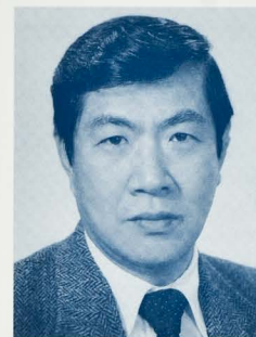
Henry C. Lee, Ph.D.