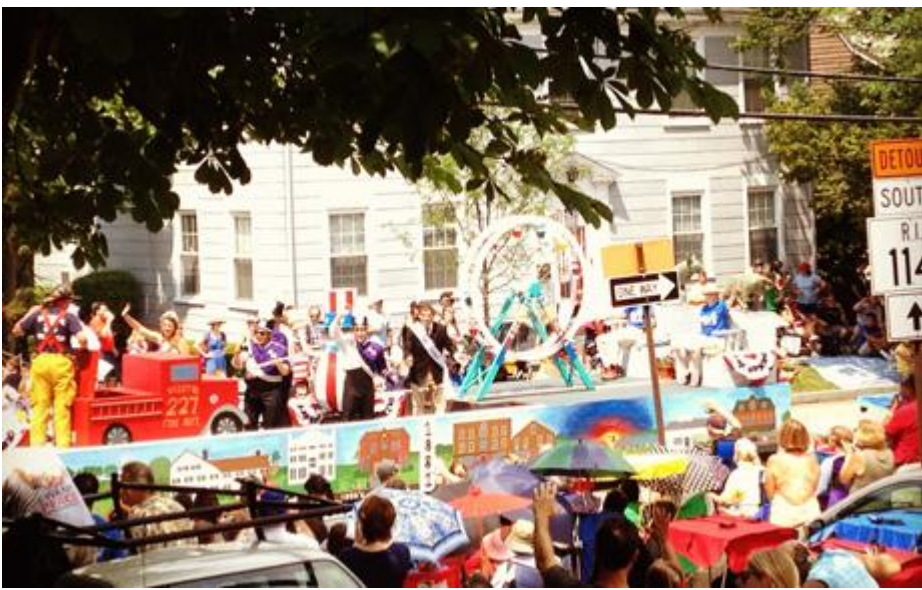
The Roger Williams University float delights the crowd at the corner of Hope and Oliver streets in downtown Bristol.

Each year, the RWU Orientation advisors imagine a theme, design a float and construct it in time for Bristol's famed Fourth of July festivities