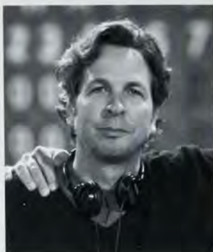
Peter Farrelly Writer and Director Doctor of Fine Arts honoris causa

Peter Farrelly and his younger brother Bobby grew up in Cumberland, Rhode Island.