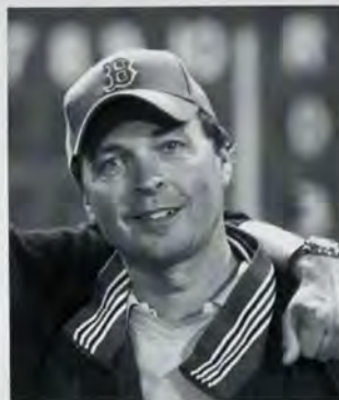
Bobby Farrelly Writer and Director Doctor of Fine Arts honoris causa

Given this nineteenth day of May, two thousand and seven.