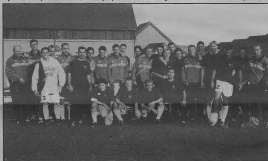
The 1999 Commonwealth Coast Conference champs

Despite losing in the first round, the Hawks had nothing to be sorry about. They had a truly amazing season in which they were rewarded with a championship and a first ever appearance in the Division III NCAA tournament. It was great to watch this team play and they provided us with many enjoyable weekends and weekdays on campus. With a majority of the team coming back next year, we can only hope for the same great season they had this year. Thanks to the players and coaching staff who made this all possible.