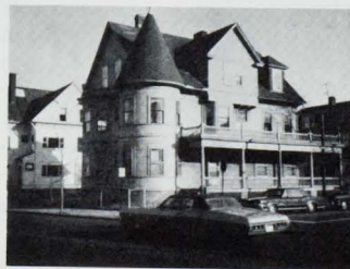
596 Broad Street