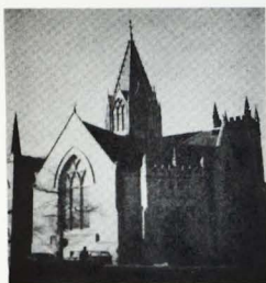
Calvary Baptist Church