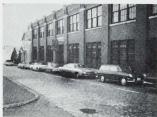
274 Pine Street