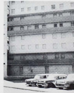
Hartford Park Campus

"We, three mothers from the Hartford Park Project, want to give credit to the boys of the Roger Williams College who live on the Hartford Park campus. They are taking time out to be Big Buddies to some of the children around here. Today all we hear and read about are the bad things some of the young people are doing....what a thrill it is to see your son look up to some young man for a change...."