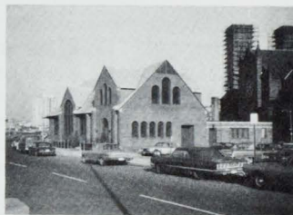
Armenian Congregational Church