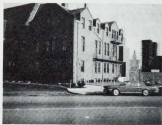
All Saints Episcopal Church