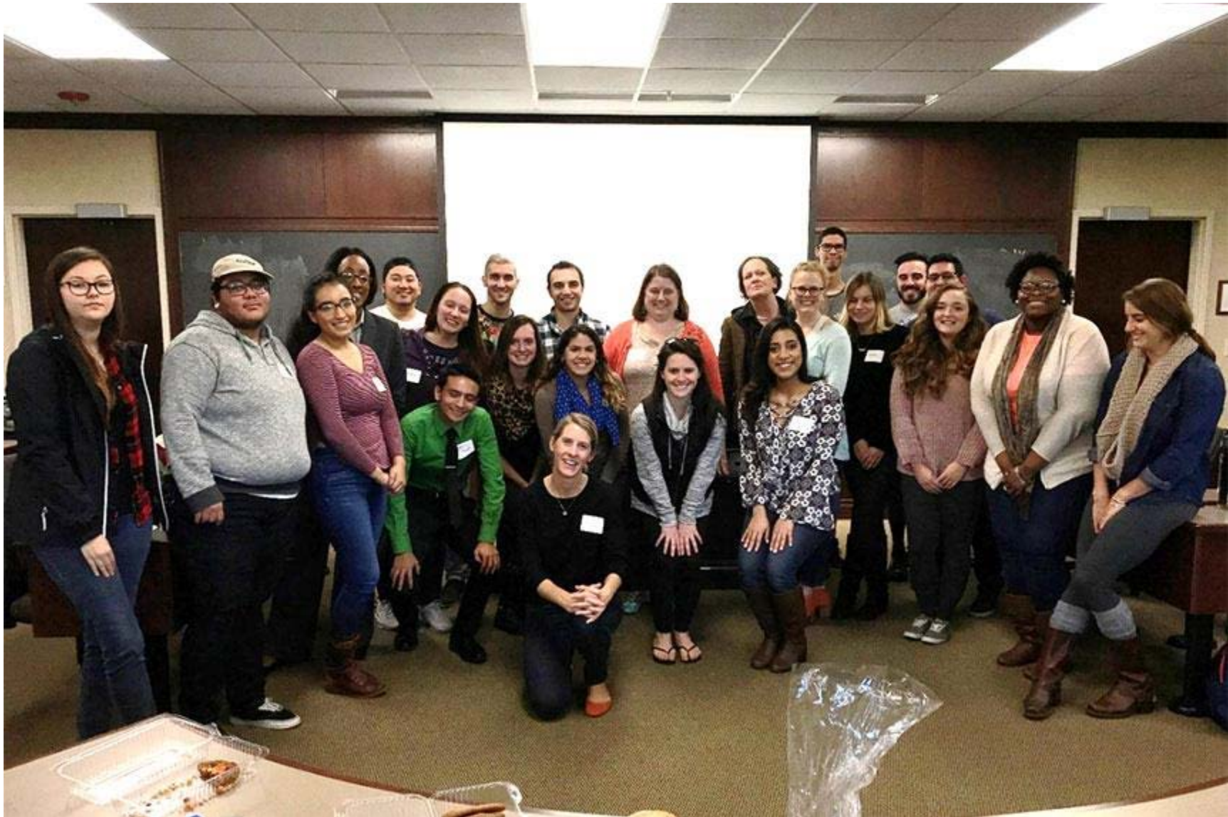
The Pro Bono Collaborative Street Law Project teaches teens about the law and inspires future lawyers. From the first class on “What is a crime?” to the nuances of the 4th Amendment, RWU Law’s Street Law program brings the law to life and makes it accessible to teenagers at