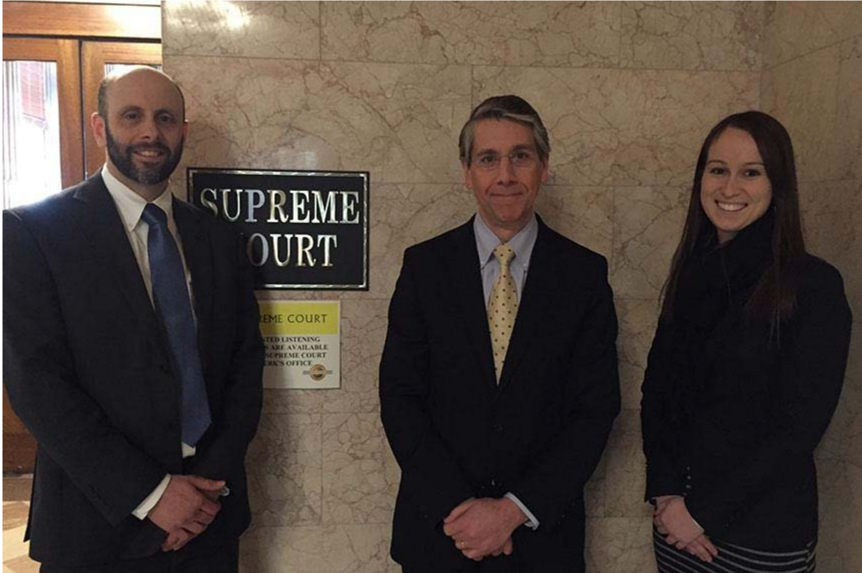
As part of the Pro Bono Collaborative Access to Justice Impact Project: Limited Scope Representation, the PBC Advisory Board and the RI Bar

dozens of local schools in Newport, Providence, Pawtucket and Central Falls.