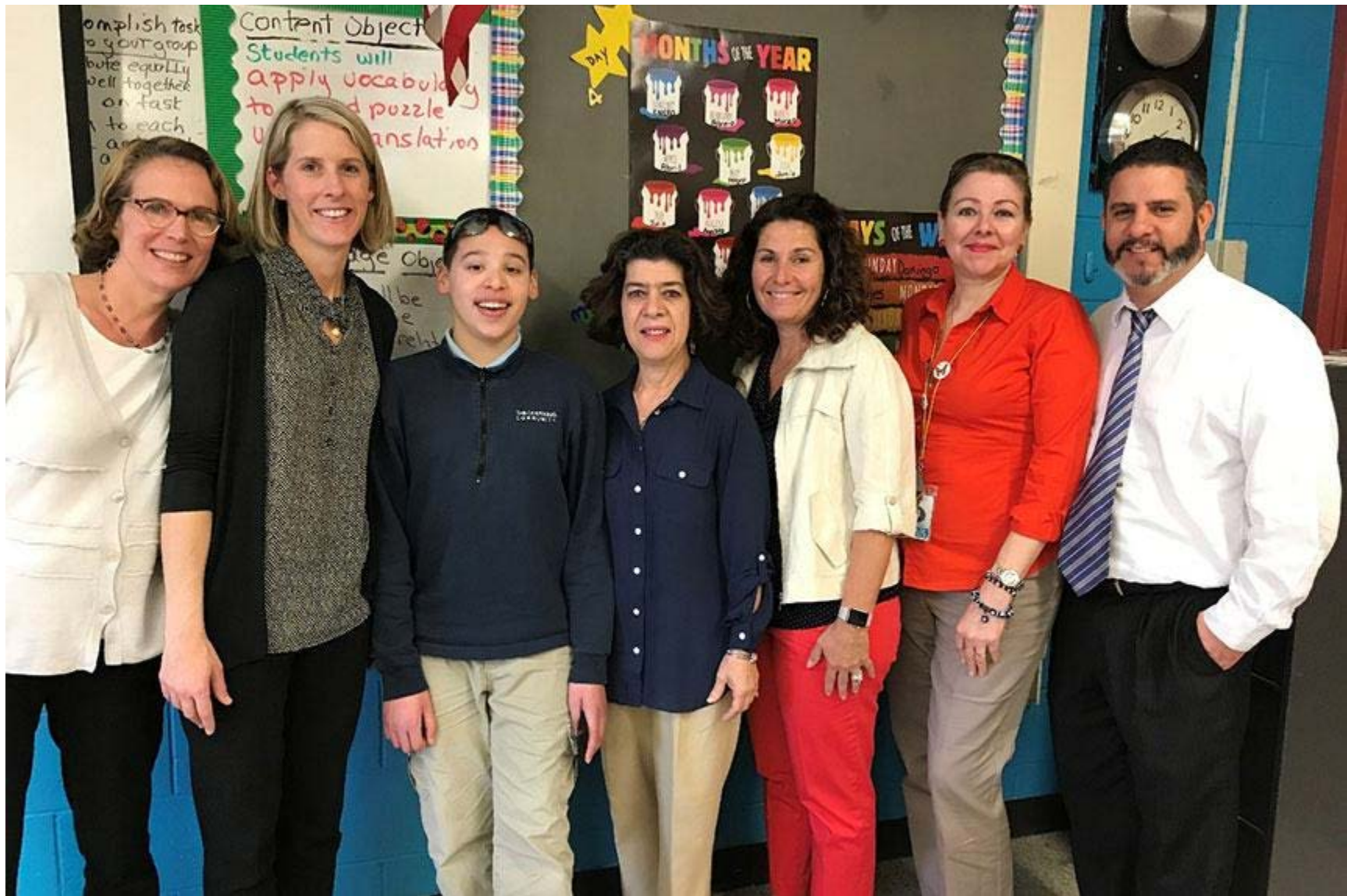
The Pro Bono Collaborative Immigrant Family Preparedness Project provides training for attorneys and community liaisons at Central Falls Middle School. We have been preparing immigrant parents of minor children for the possibility of detention or deportation by assisting them in