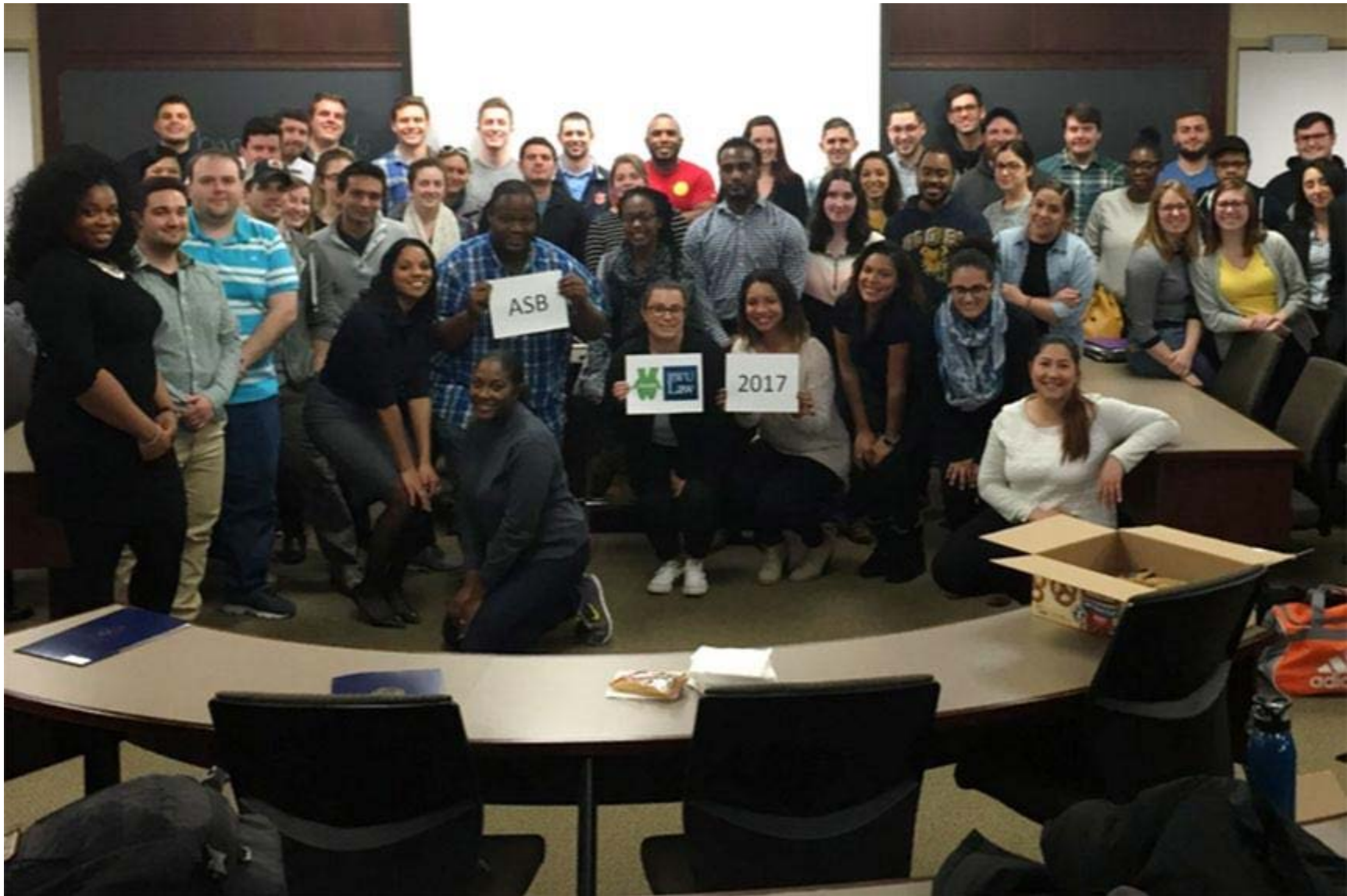
Alternative Spring Break was started in 2005 by the Association for Public Interest Law (APIL) at Roger Williams University School of Law in the wake of Hurricane Katrina as a way for students to assist those recovering from devastation. The 2017 program was one of the largest and most