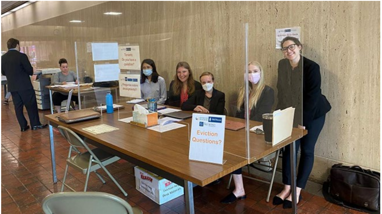
RWU Law students volunteers at the Providence Eviction Help Desk