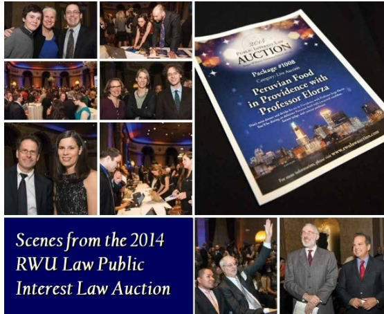
Scenes from the 2014 RWU Law Public Interest Law Auction