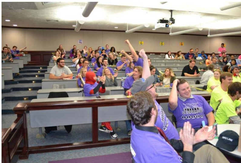
That's worth $1000!