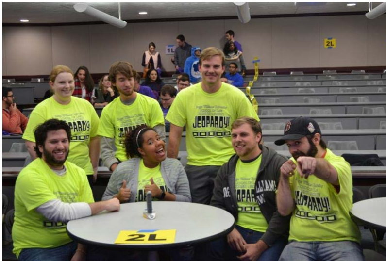
2Ls in Game Mode: