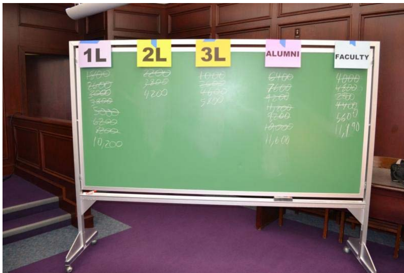
End of Double Jeopardy, Narrow Faculty Lead