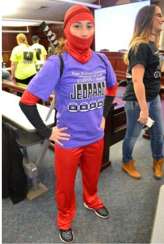
1Ls brought a Ninja Warrior to the Fray