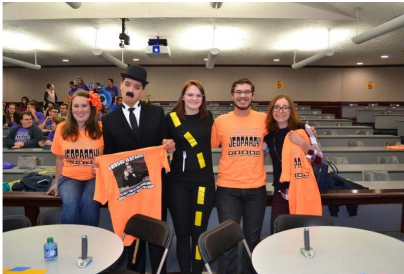
3Ls Ready to Rumble: